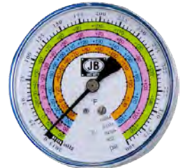
M2-400 4" Illuminating, Class 1, 1%