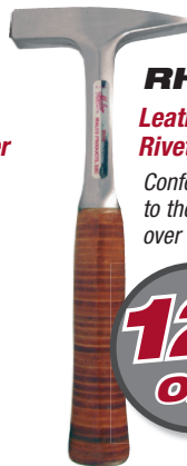
RH4 Leather Grippped Riveting Hammer Conforms perfectly to the user's hand over time.