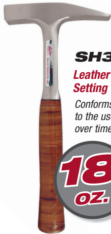
SH3 Leather Grippped Setting Hammer Conforms perfectly to the user's hand over time.