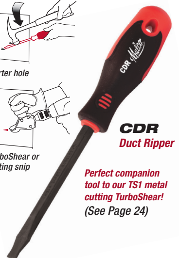
CDR Duct Ripper

Perfect companion tool to our TS1 metal cutting TurboShear! (See Page 24)