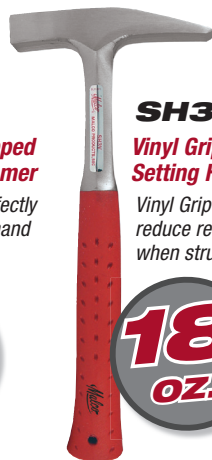
SH3V Vinyl Grippped Setting Hammer Vinyl Grip helps reduce recoil when struck.