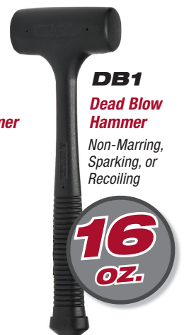
DB1 Dead Blow Hammer Non-Marring, Sparking, or Recoiling