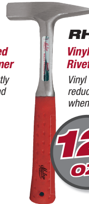
RH4V Vinyl Grippped Riveting Hammer Vinyl Grip helps reduce recoil when struck.