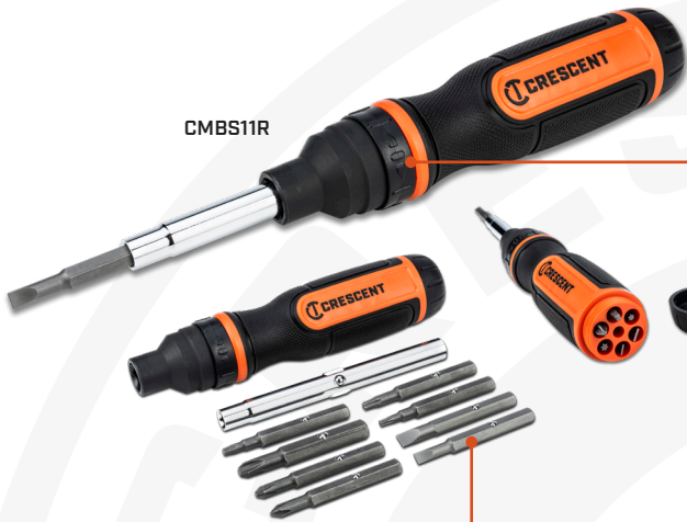
High Torque Ratchet Driver Allows for faster driving