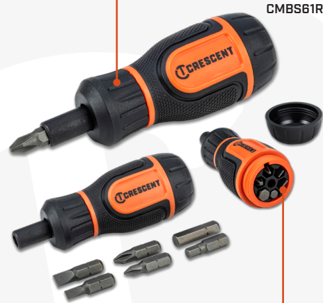
End Cap Bit Storage Keeps bits organized and easily accessible