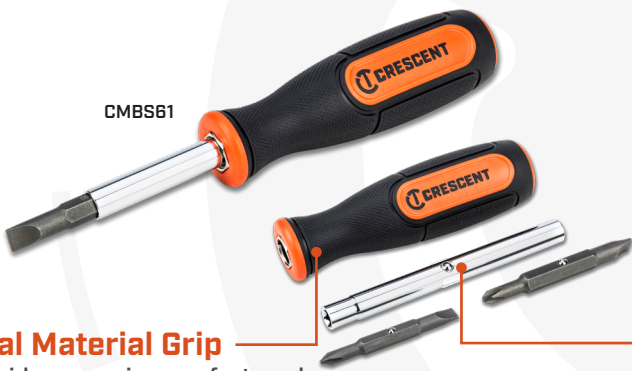
Dual Material Grip Provides superior comfort, and is oil and solvent resistant